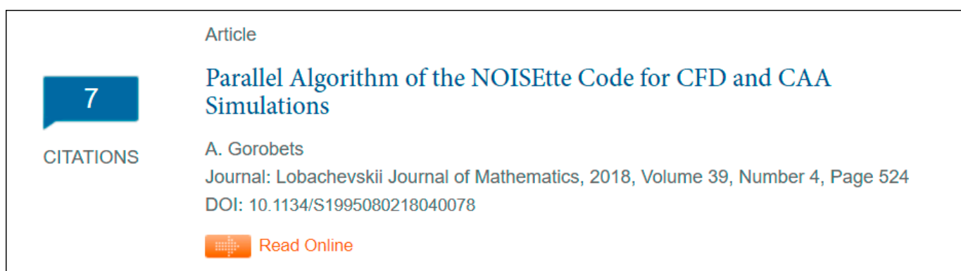
Figure 3. Bibliographic reference on the website of the Springer publishing house [44]. On the left is the living number of citations of the article.

There are various reasons, including that the PDF representation of a bibliographic reference is uncomfortable in terms of using copy and paste because extra line breaks appear in the copy. On the websites of many publishers, the full texts of the publications are available only for a fee, however, the bibliography as the main source of bibliometrics is usually available for free, and in this case, it is presented as an auxiliary file in a HTML format. Bibliographic references in the table of contents of an overlay journal [12] are usually presented in a HTML format since the date of birth of the last revision of the current publication is highly desirable here. The HTML format allows each bibliographic reference to be clearly and effectively supplemented with a living number of articles that link to it (Figure 3).