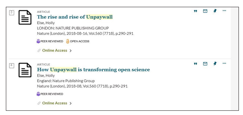
Figure 3. Screenshot of discovery system showing two discovery points for the exact same article appearing slightly different due to the metadata supplied

Figure 3 shows an example of two articles from the same publisher. Both appear to be different but are in fact the same article referenced from two different URLs. Both are presented in a commercial library discovery system search for the term 'Unpaywall', so provide ready access to the content, but add to confusion by presenting different 'discoverable' metadata. This could lead to incorrect citations, particularly if the discovery system is used to generate the citation.