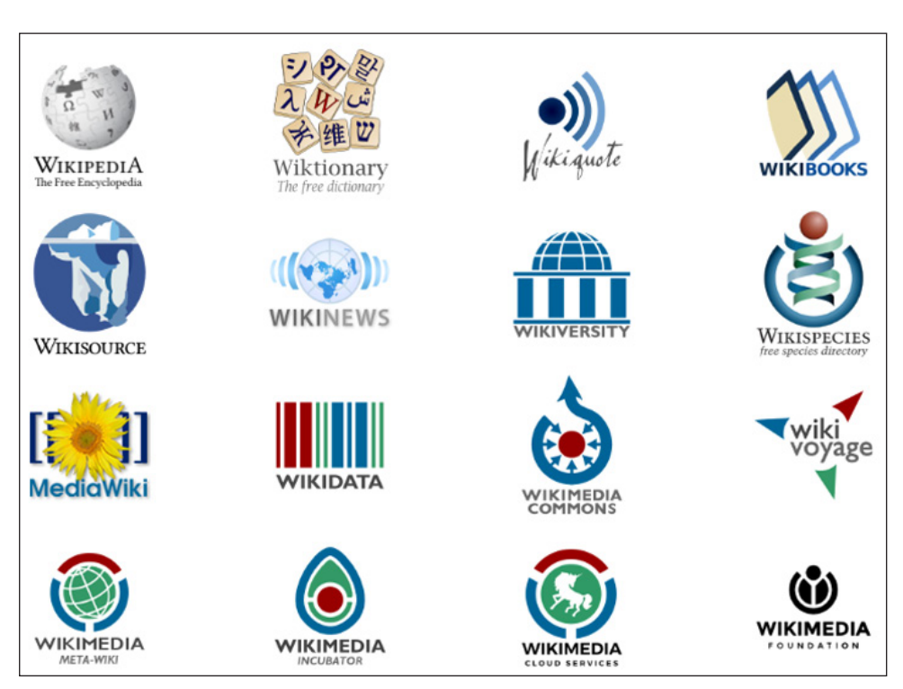
Figure 1. The icons of the 16 Wikimedia projects<sup>21</sup>

Whereas commercial sites aspire to traffic and 'clicks', the goal of Wikimedia is to freely share knowledge in the most convenient form for its users. So, these platforms encourage reuse of text, images and data in other sites, publications and printed material, even in CD-ROMs or USB drives that are sent to schools in remote areas of the world.<sup>20</sup>