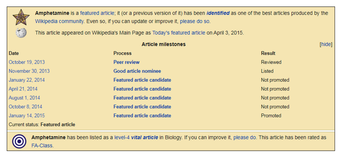
Figure 2. The 'Article milestones' section on the Talk page shows the formal reviews to which the Amphetamine article was subjected before earning its 'featured article' badge. Screenshot with article milestones expanded<sup>26</sup>

Wikipedia ... does not compete with the scholarly literature but makes it accessible to the widest possible audience'