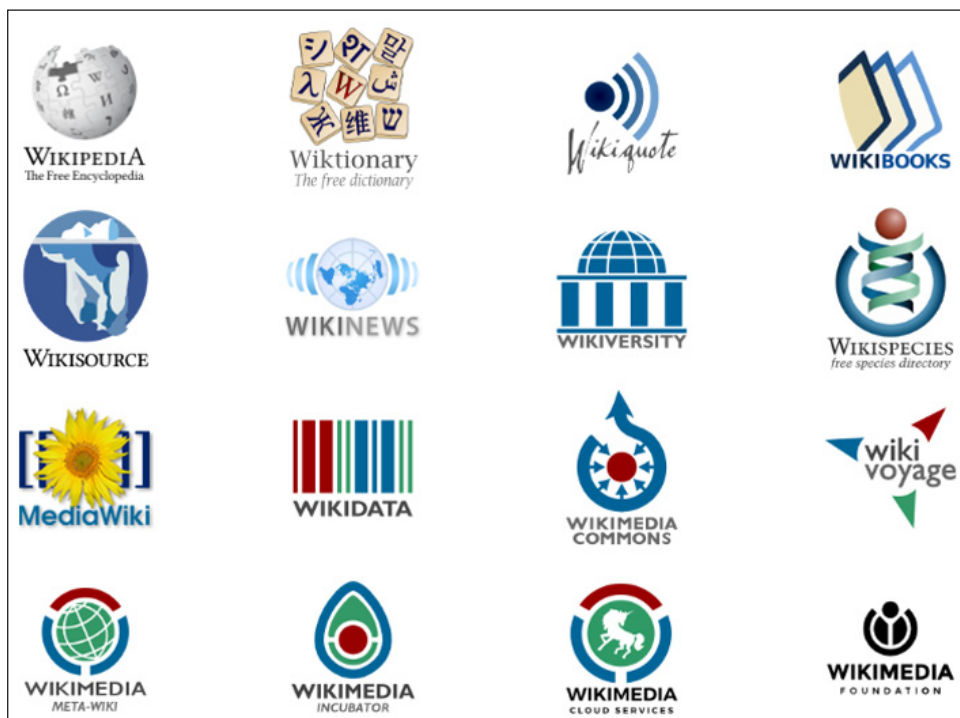
Figure 1. The icons of the 16 Wikimedia projects 21

Whereas commercial sites aspire to traffic and 'clicks', the goal of Wikimedia is to freely share knowledge in the most convenient form for its users. So, these platforms encourage reuse of text, images and data in other sites, publications and printed material, even in CD-ROMs or USB drives that are sent to schools in remote areas of the world. 20