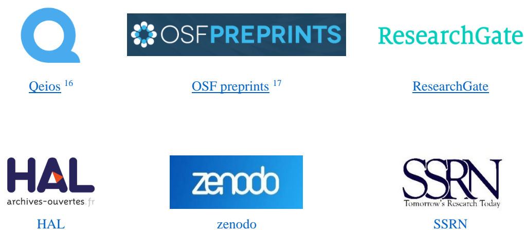
Fig. 1. Recommended free eprint repositories (all assign DOI).