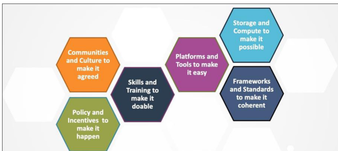
Figure 1: Key focus areas required to bring about an effective research data commons (inspired by a diagram from the Center for Open Science).

In line with Australia's learnings from previous work in this area, ARDC identifies partnerships as key to its mission, with responsibility frameworks needed to articulate roles and responsibilities, to ensure development of sustainable frameworks. While ARDC will function as a coordinating organisation to motivate and energise this activity, the commons itself must be a collaborative endeavour, developed in concert with broader data issues and interests. ARDC's engagement strategy aims to facilitate effective engagement at the appropriate level with strategic stakeholders of all types throughout the sector, to achieve the transformational goals shared by both ARDC and the larger community. Given the way responsibilities are shared