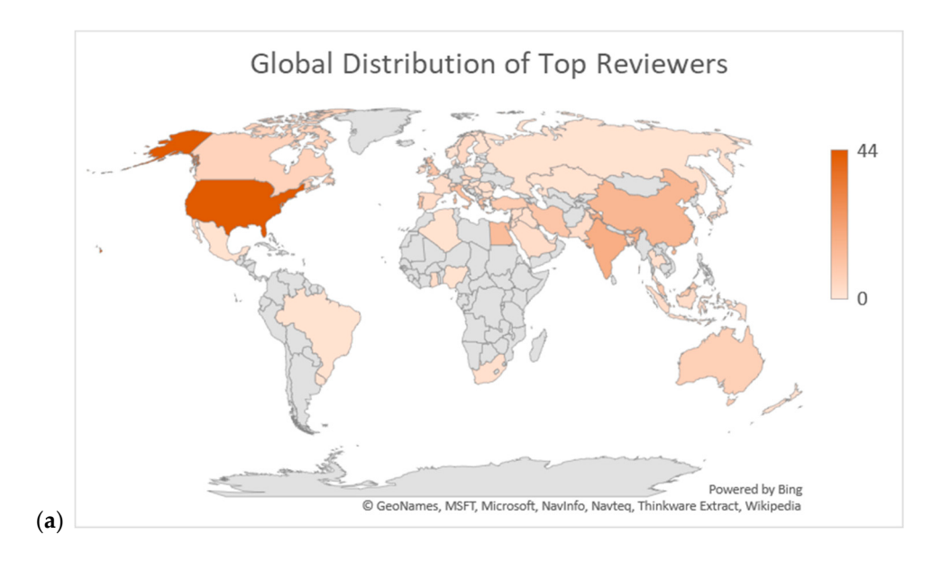
Figure 2. Cont.

Lastly, we tried to map where the world's top reviewers are and the reviewers/reviews intensity of the different countries. This is shown in Figure 2a,b respectively. The usual suspects emerged right at the top. The USA, China, and India hosted the most reviewers, who in turn did most of the reviews. It is interesting to see that in the whole of Latin America, which is home to 652 million people, there were nearly no reviewers in the Top 250 (with the exclusion of one from Brazil and one from Mexico). The vast majority of African countries were also underrepresented, apart from Egypt, which showed a surprising total of 13 reviewers in the Top 250 (which makes Egypt fourth, both in terms of reviews and reviewers in the sample we analysed). Other countries that scored in the Top 10 of reviewers and reviews were Greece, Iran, Italy, Portugal, Turkey, Malaysia, and the UK.