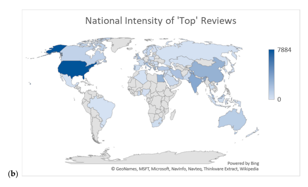
Figure 2. (a) Global distribution of the 250-strong sample of top reviewers. (b) Global distribution of the 46,079-strong sample of 'top' reviews.

It is worth noting a mismatch between countries' research outputs and their supply of top reviewers. This is shown in Table 1. Interestingly, countries traditionally strong in academic outputs (i.e., Japan, Brazil, and Germany) did not show a similar profile when it came to global top reviewers. Significantly, not a single German scholar featured in the Top 250 global reviewers that we analysed.