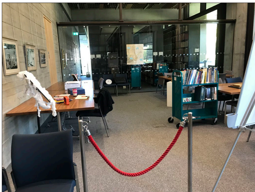
Open Access Escape Room Layout, University of Essex, October 2018

The final design of our Escape Room has three main OA parts and seven puzzles. The game is set in the future and in this virtual future all research is published with no cost to the reader or author. The game was designed this way in order to introduce diamond OA to players without bombarding them with information about all the various routes to OA at once. It is also a way to create more discussion around the current publishing landscape after players finish the game.