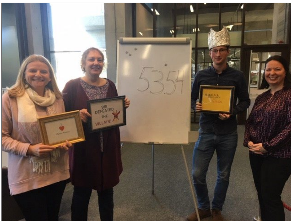
A team from the UK Data Archive after they completed the Open Access Escape Room, University of Essex, October 2018

Players were really positive after having just defeated the villain of the Escape Room so they were open to talking about OA, and it was easy to get a conversation going. Every conversation was different, but had the same basic elements in them: the routes to OA, the benefits of OA and what can be made open. There was also discussion around why some research is not freely available, the current landscape of scholarly communication and possible changes in the future, mostly linked to Plan S.