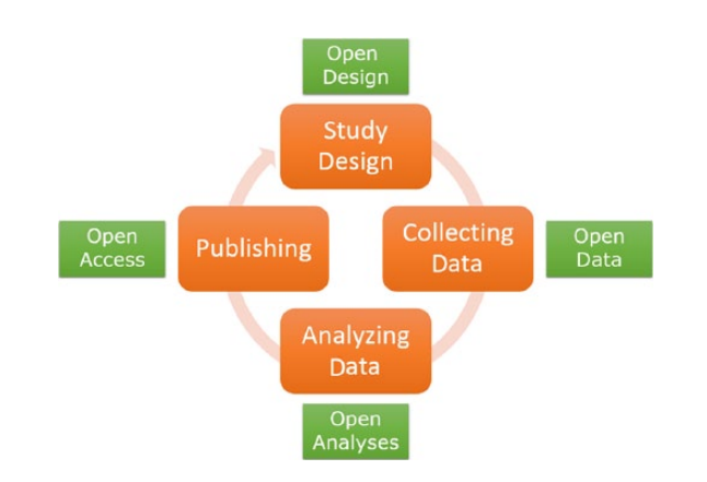
FIGURE 1. The open research cycle.

access in scholarly research. There is no single philosophy or unified solution advanced by Open Science advocates (Fecher & Friesike, 2014) but rather, a constellation of emerging ideas, norms, and practices being discussed in a wide variety of fields (see Table 1).