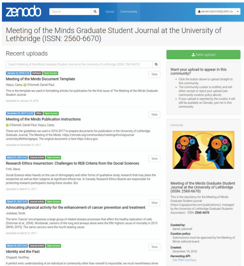
Figure 4: The front page of the Meeting of the Minds Zenodo Community

The second dissemination route is via a free Wordpress site hosted by Wordpress.com (Graduate Student Association [University of Lethbridge], 2017a) (see Figure 5).