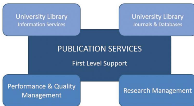
Figure 1. Initial partners of Publication Services.

cultures with a preference for both print and digital publishing. This signifies a departure from services other libraries offer that focus primarily on digital publishing. Consequently, Open Access, which is the nucleus that connects the Department of Information Services and the Department for Journals and Databases, is one of many topics the services address. Publication Services was thus defined as an information provider of key knowledge, best practice examples, especially at the University of Graz, and recent developments. The name Publication Services was chosen as it represents services that are already established and is more poignant in German than “scholarly communications.” The target audiences are the 3,000 scholars employed at the University of Graz, scholars joining the academic staff at the University of Graz and the students who are studying for a PhD or will be publishing for the first time.