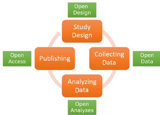
FIGURE 1. The open research cycle.

access in scholarly research. There is no single philosophy or unified solution advanced by Open Science advocates (Fecher & Friesike, 2014) but rather, a constellation of emerging ideas, norms, and practices being discussed in a wide variety of fields (see Table 1).